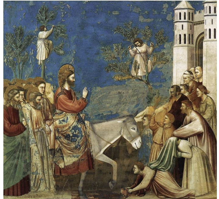
Entry into Jerusalem by Giotto di Bondone c1303-1305