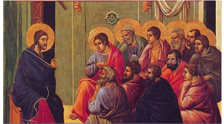
Farewell Discourse by Duccio 1308-1311