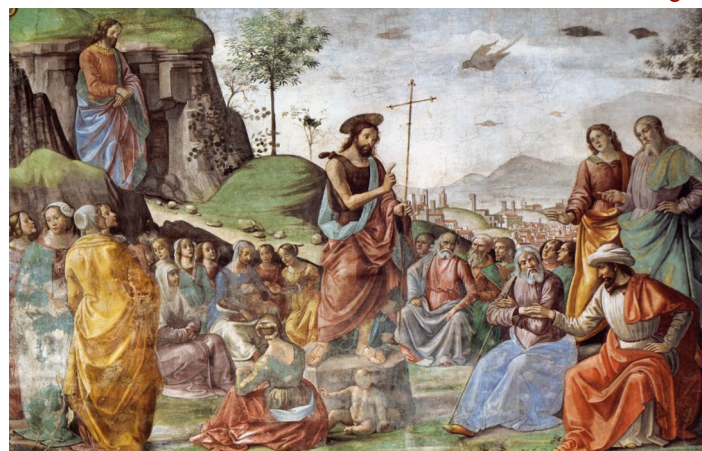
Preaching of St John the Baptist - Domenico Ghirlandaio c1486-1490